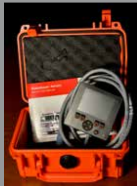
Case not included

Keeping trucks in service is our number one goal, that is why we do our best to use products that are available on the market and are not proprietary to Rosenbauer. An aerial service tool is also available for quick and easy diagnostics of the CAN-bus system.