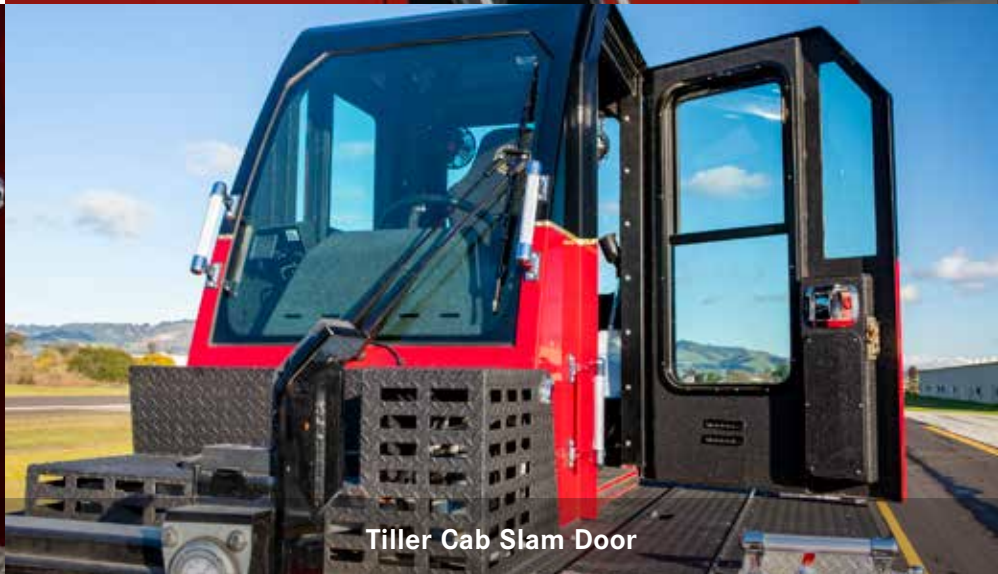
Tiller Cab Slam Door