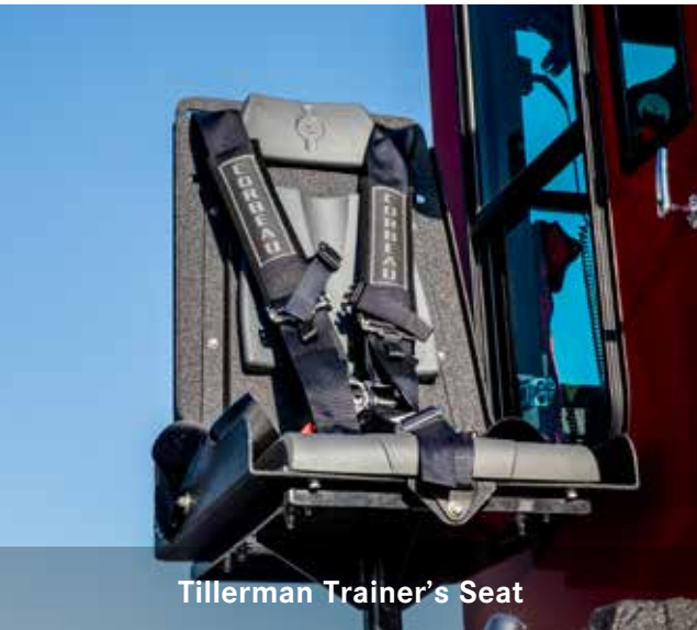
Tillerman Trainer's Seat