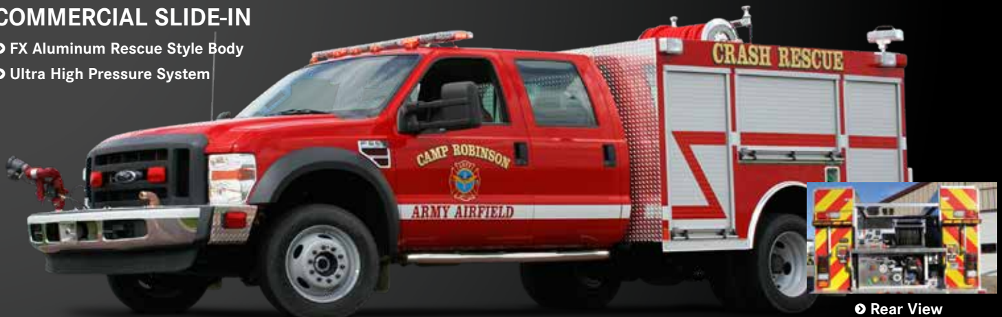
◆ Rear View