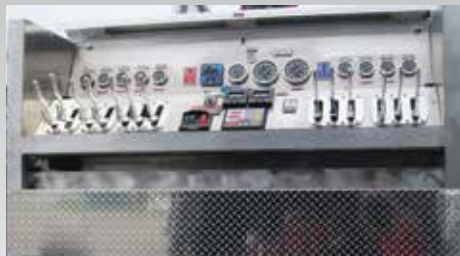
Top Mount Control Panel