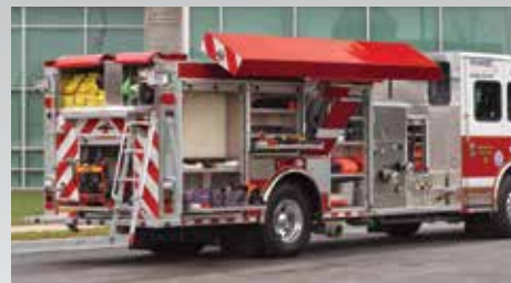
Enclosed Ground Ladder Storage