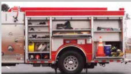
Customized Compartment Storage