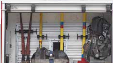
Customizable Tool Storage