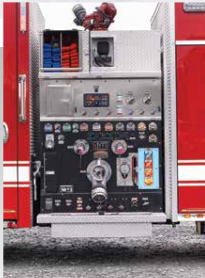
Black Thermal Coated Control Panel