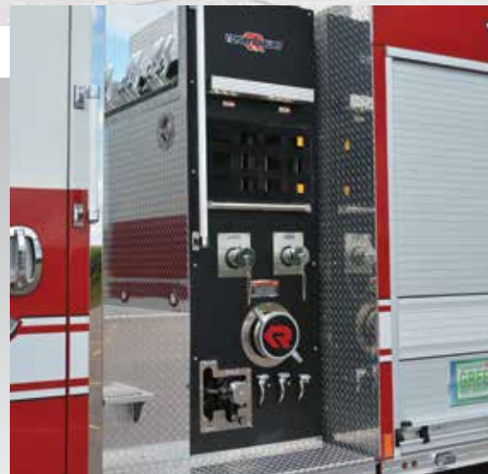
TP3 Pump Control Panel with Sealed Bank