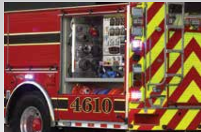
Operator's Side Pump Control Panel