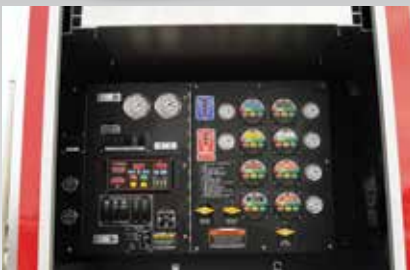
Curb Side Pump Control Panel