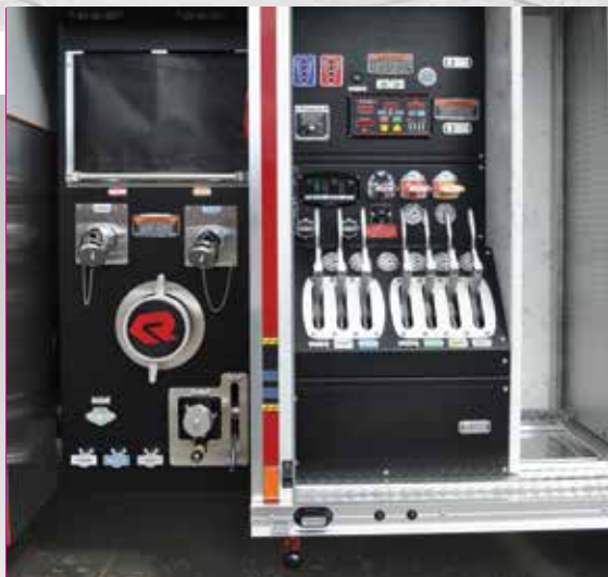
MP3™ Pump Control Panel with Sealed Bank