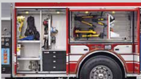
Full-Depth, Full-Height Side Compartment