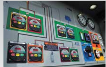
Logi-Color Pump Control Panel