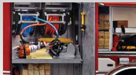
Full-Width Access Compartments