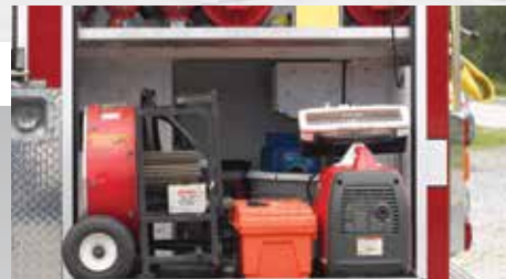
Slide-Out Equipment Trays