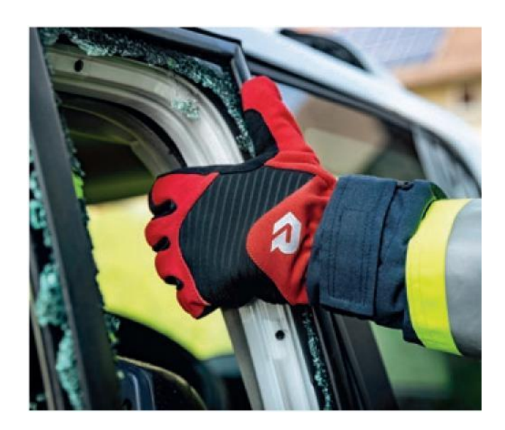
High mechanical protection properties against cuts, abrasions, etc.

Whether it's work on vehicles involved in accidents or other firefighting/extrication activities - the GLOROS T1 is the right glove for your protection. But the gloves do not protect against chemical, electrostatic, and thermal hazards. Specifically, this glove is not intended for use in fire operations (our proven SAFE GRIP 3 models are available for this). However, GLOROS T1 offers a certain basic protection against contact heat up to 482°F/250°C (according to EN407).