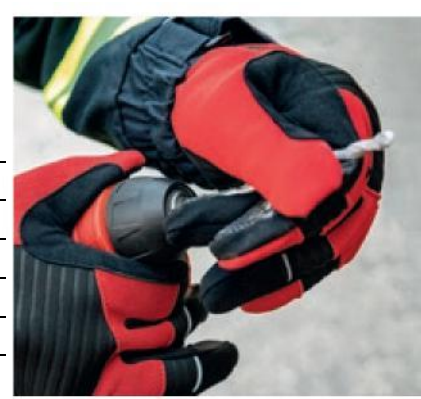
Excellent dexterity and high sense of touch